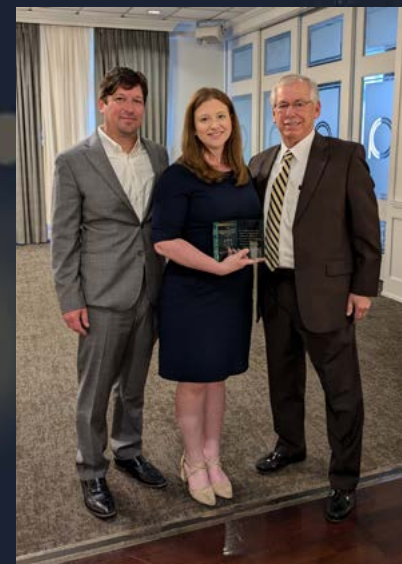
THE STEVEN JAMES MATT BEYOND THE BOOKS AWARD