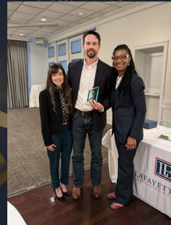
OUTSTANDING H.E.L.P. AWARD