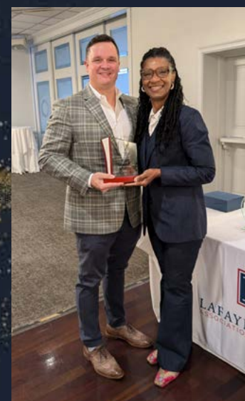
TOP CORPORATE FINANCIAL CONTRIBUTOR AWARD