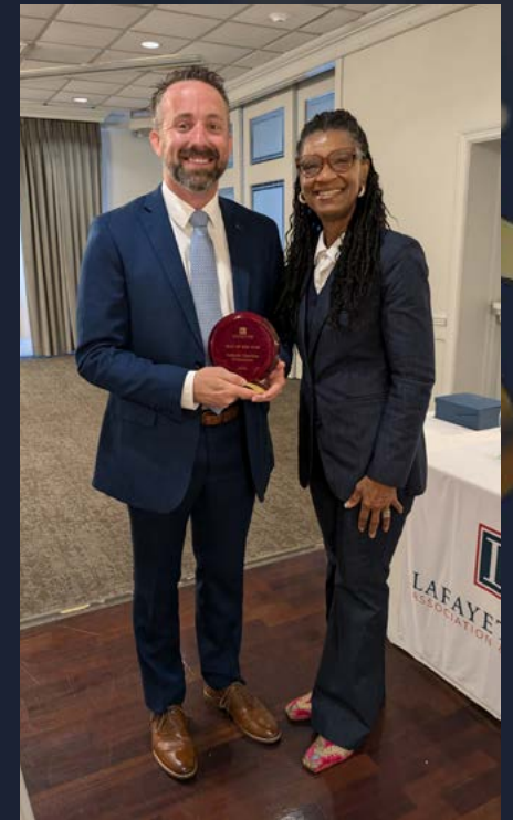
ALLY OF THE YEAR AWARD