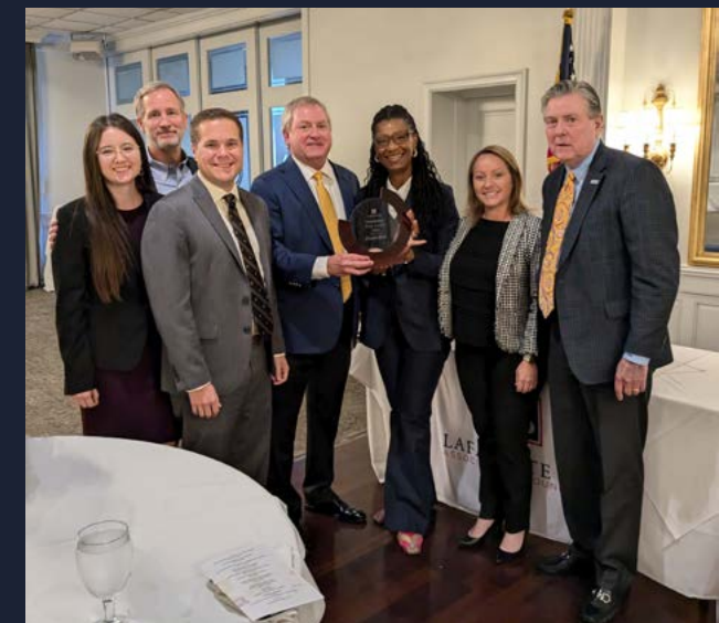
OUTSTANDING FIRM AWARD